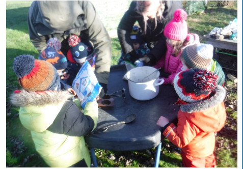
Making bird feeders